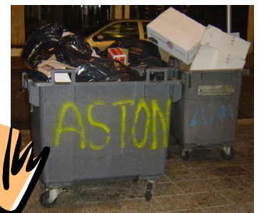
Aston's bins in Nice!