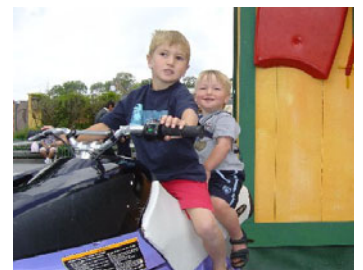
Jet Skiing in Disney